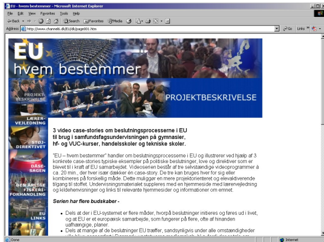
Website for educational series "EU – Who decides?" © 2003 Channel 6 Television

For many TV or video productions we also produce a website to support the project.